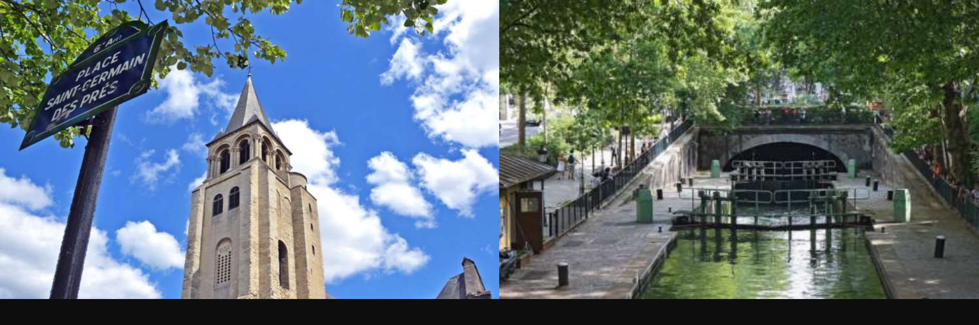
3 Days Suggested Itinerary