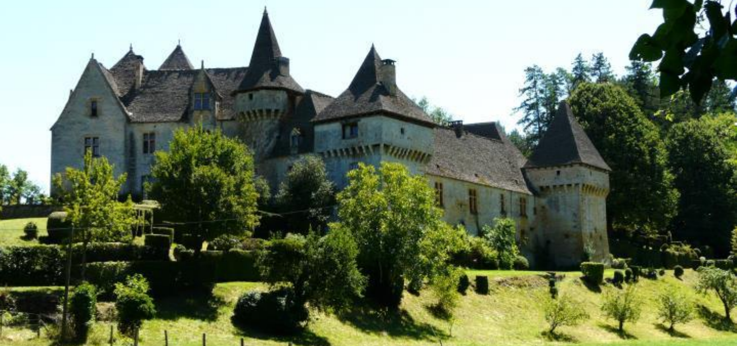
Saint Amand de Coly