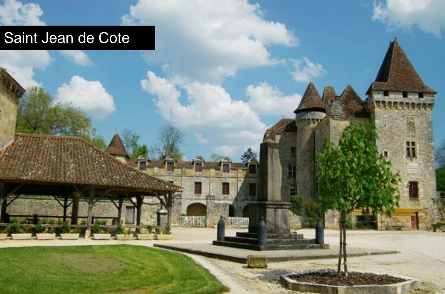
Saint Jean de Cote